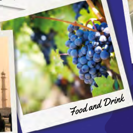
Food and Drink